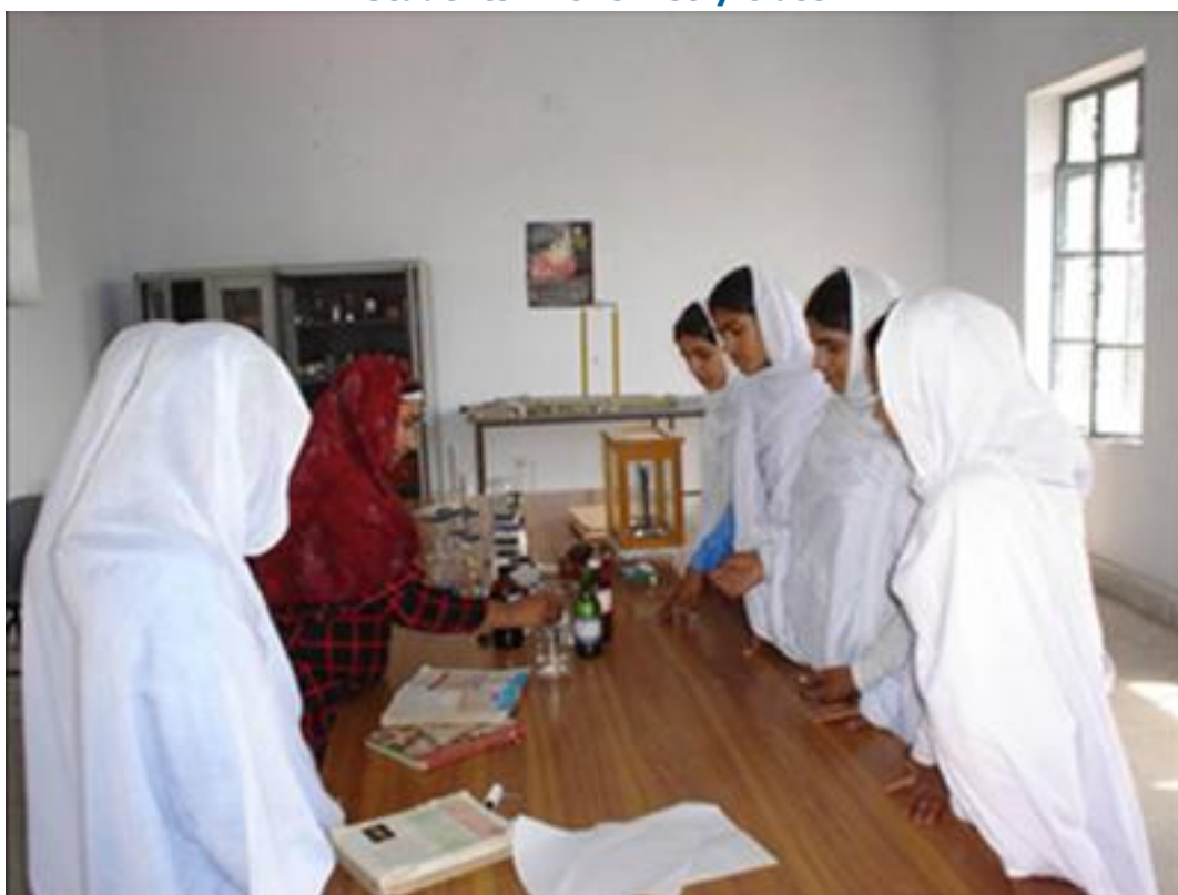
Sponsored Teacher Taking Chemistry Class