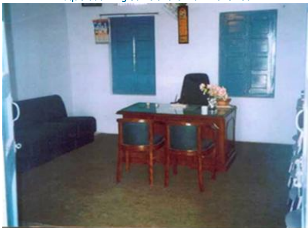
Staff Room Built 2003