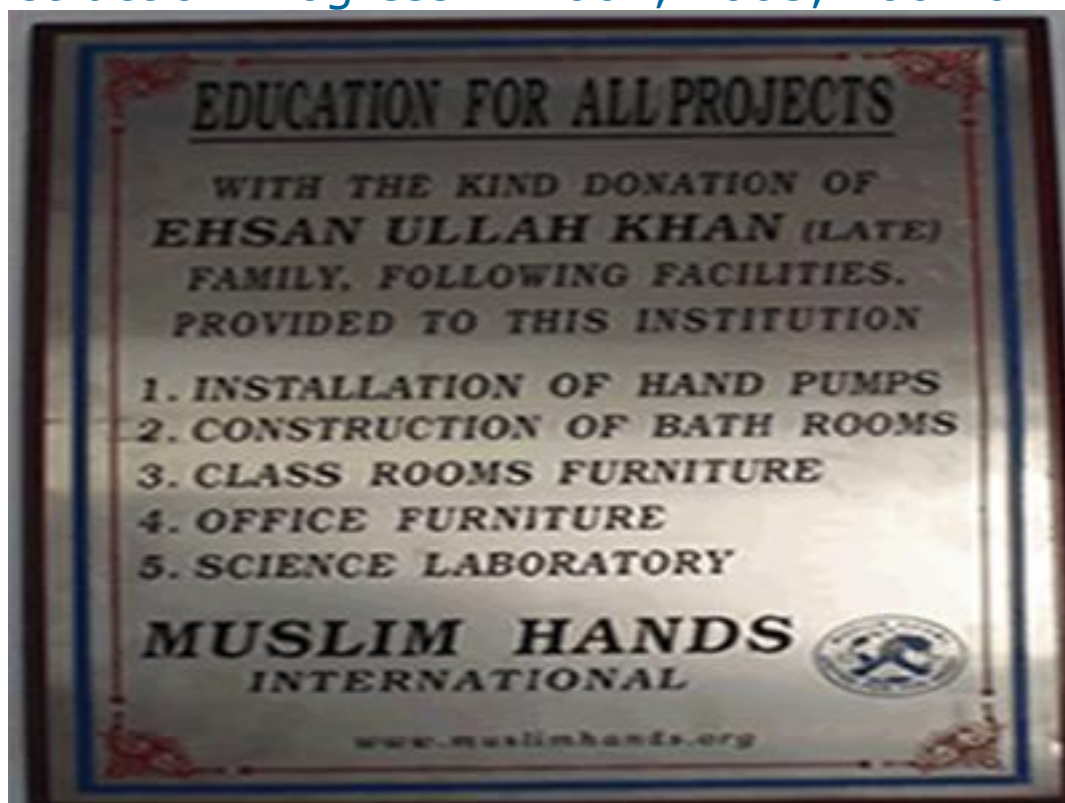
Plaque Outlining Some of the Work Done 2002