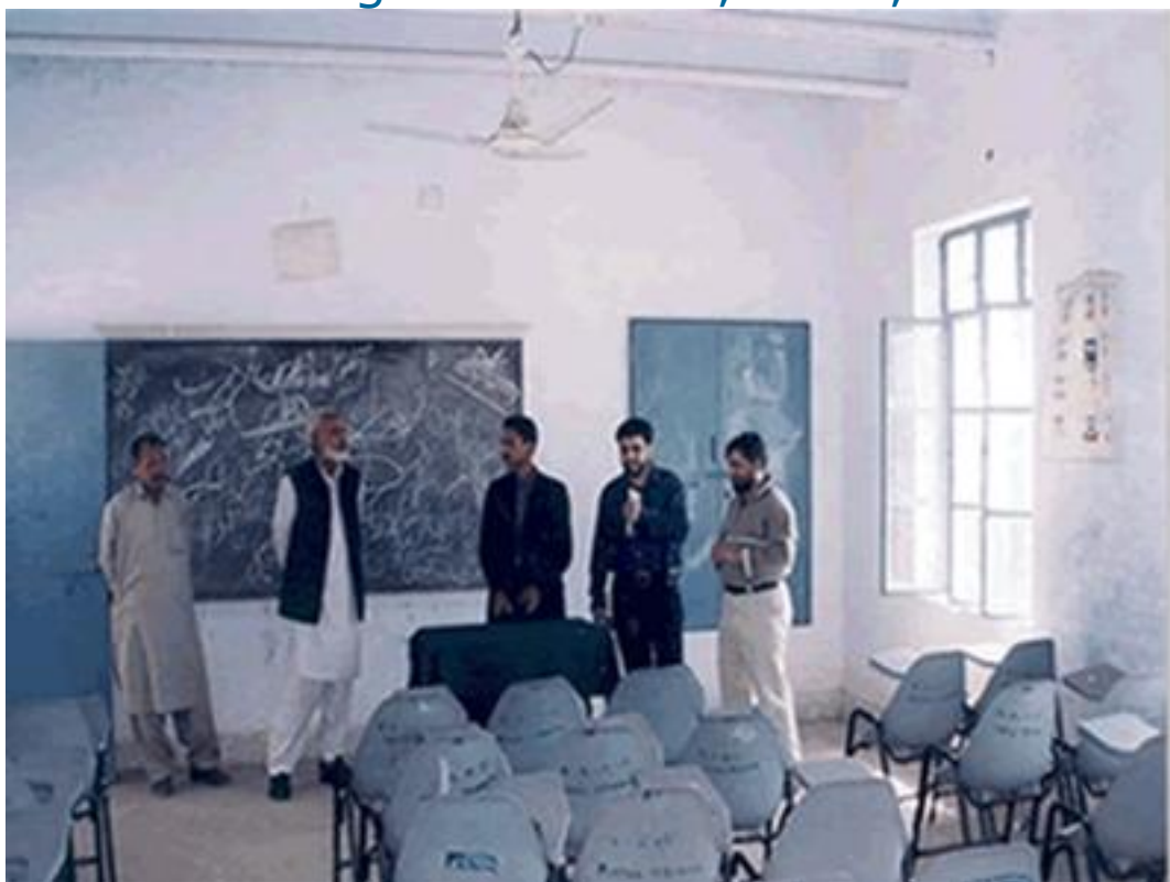
Representatives from Muslim Hands Inspecting Completed Class Room