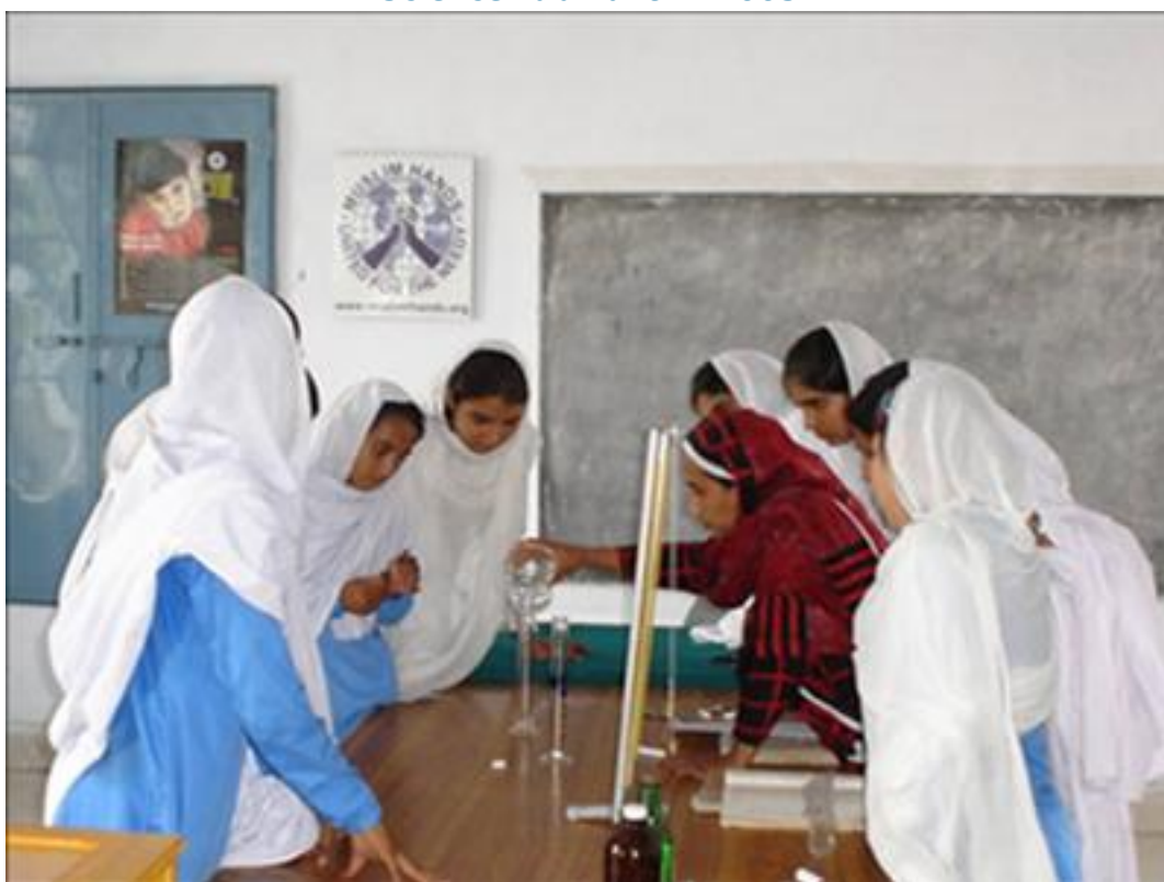
Students in Chemistry Class