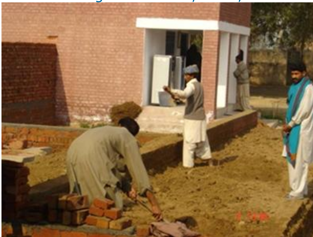
Classrooms Being Constructed From Zakat Donations, Ramadan 2004