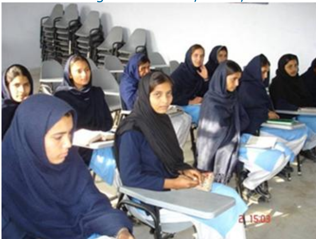
Lessons Taking Place in A Classroom Built in 2004