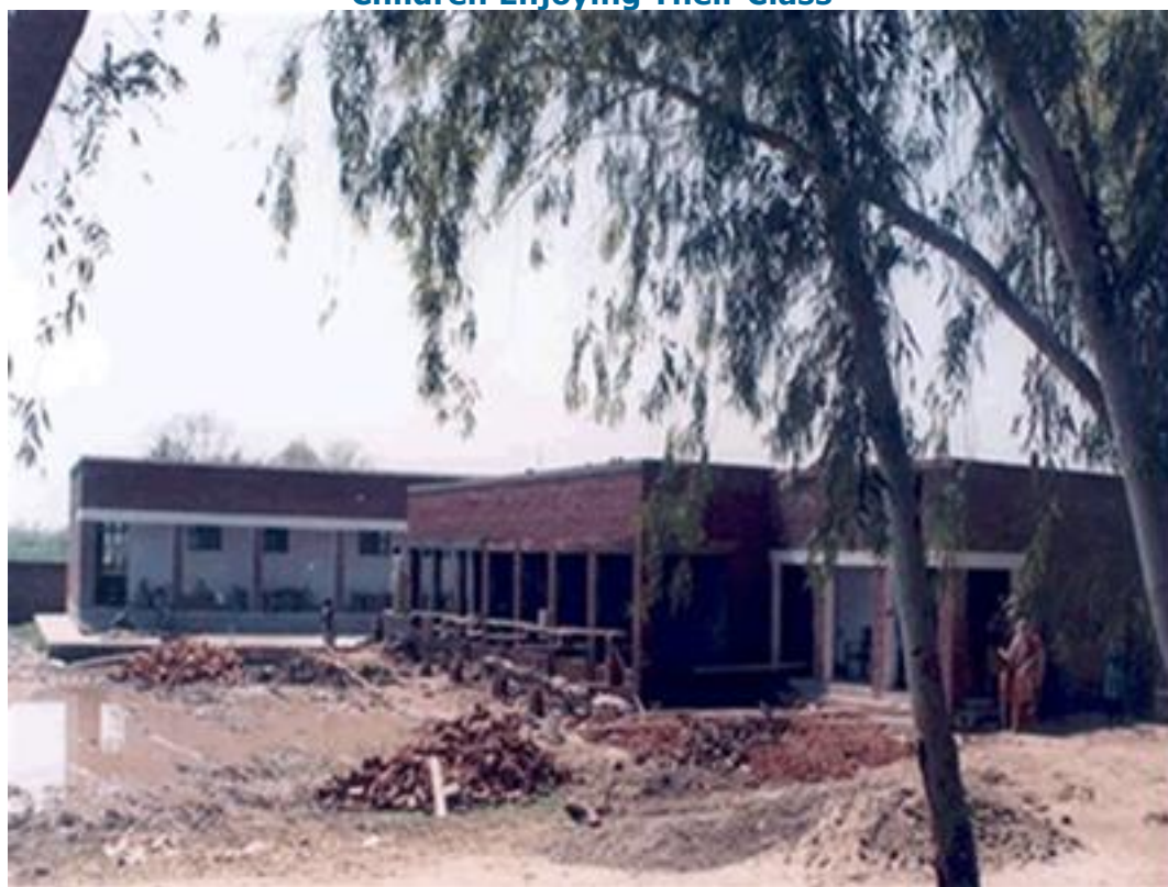
Construction of Classrooms Underway – Funding Made Available Through Donations