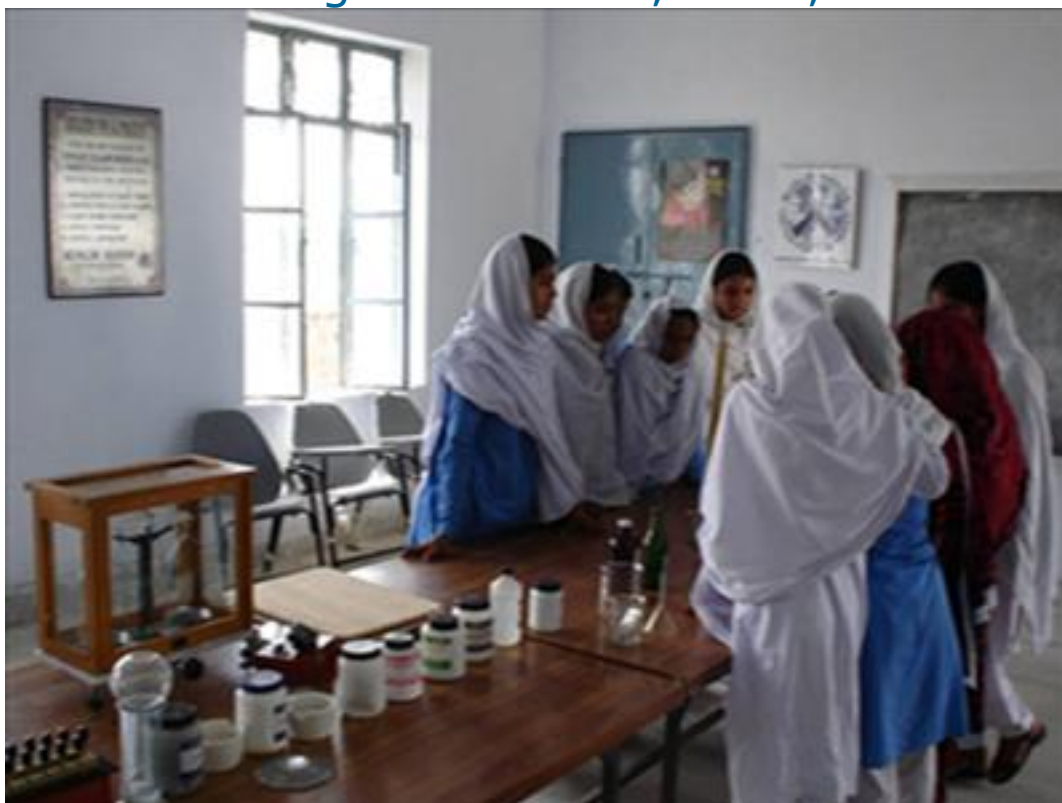
Science Lab Built In 2003