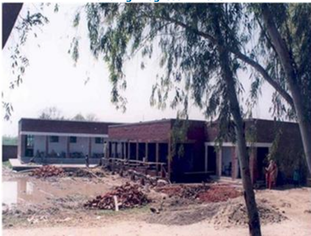
Area In front of Classroom will Become a Playground