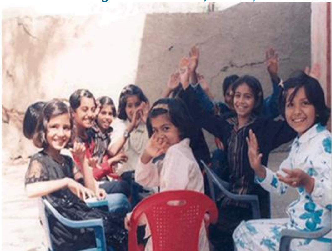
Children Enjoying Their Class