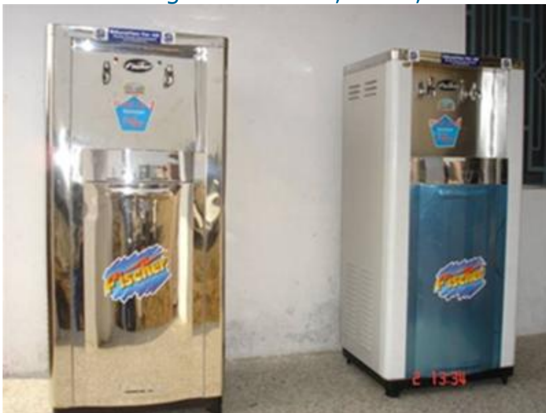
Water Coolers Donated in 2004