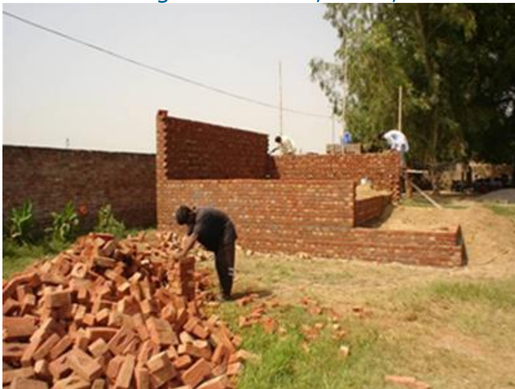
Classrooms Being Constructed From Zakat Donations, Ramadan 2004