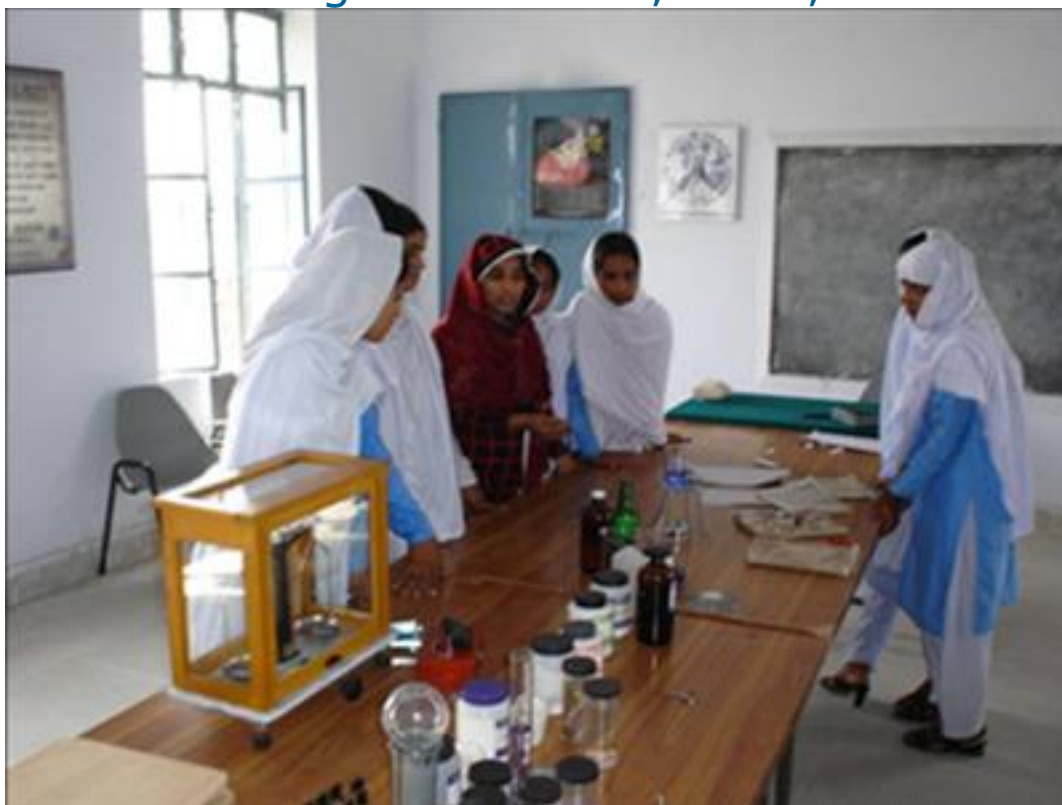
Sponsored Teacher Taking Chemistry Class