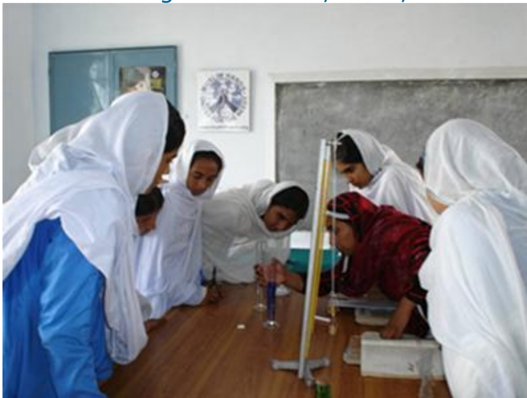
Students in Chemistry Class