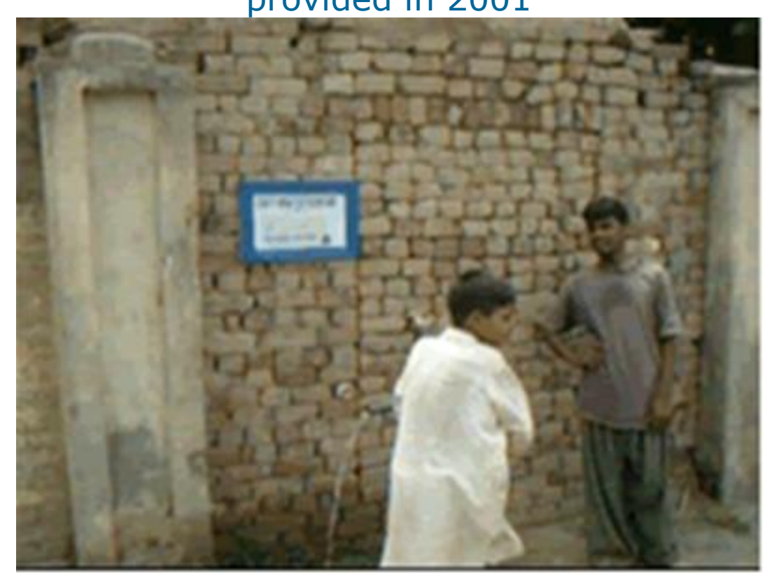
Clean running water provided in 2001

Construction Progress in 2001 & Clean running water provided in 2001