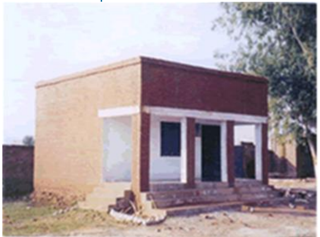
Construction Progress in 2001