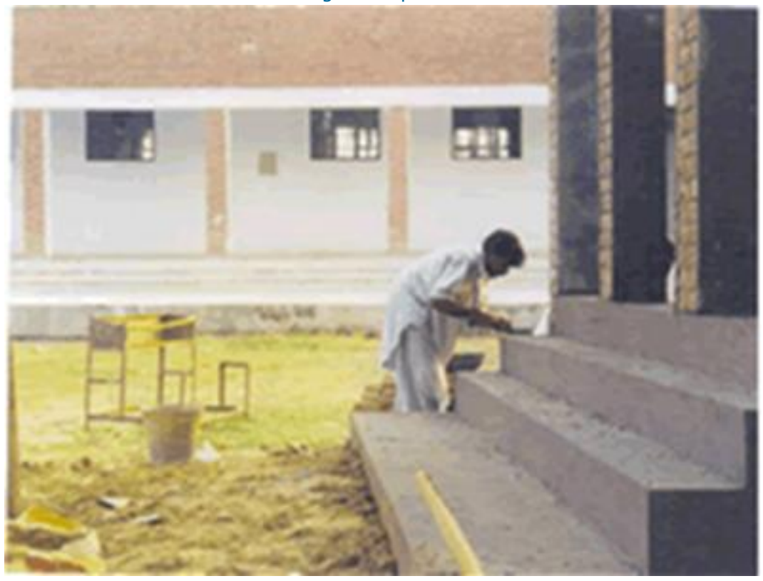
Construction Progress in 2001